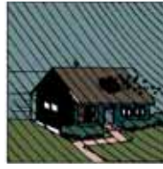
Windstorm or Hail