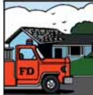
Fire Department Service Charge