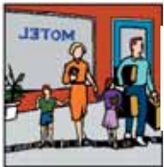
Loss of Use