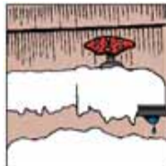
Freezing of Plumbing, Heating, or Ventilation System