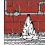
Accidental Discharge from Plumbing or Heating System