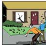
Vandalism, Riot, Civil Commotion