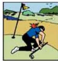
Off Premises Liability