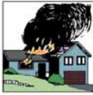
Fire or Lightning