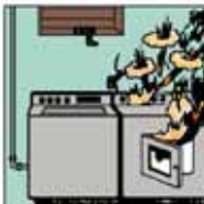
Accidental Electrical Damage