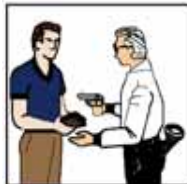
$500 Credit Card Coverage