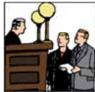
Cost to Defend Suits