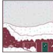
Weight of Ice, Snow, or Sleet