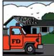
Fire Department Service Charge