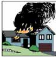
Fire or Lightning