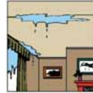
Backing Up of Ice or Snow under Shingles