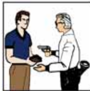
$500 Credit Card Coverage