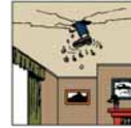
Accidental Building Damage