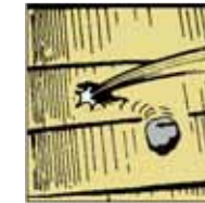
Siding Accidentally Damaged by Missiles