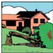
Trees, Shrubs, Other Plants