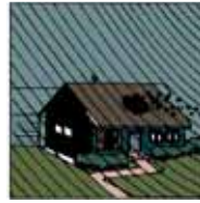
Windstorm or Hail