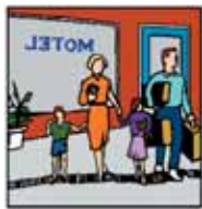
Loss of Use