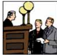
Cost to Defend Suits