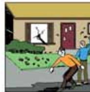
Vandalism, Riot, Civil Commotion