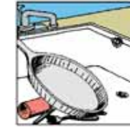
Accidental Chipping of Sink