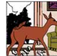
Damage from Wild Animals (with exceptions)