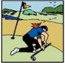
Off Premises Liability