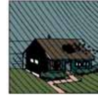
Windstorm or Hail