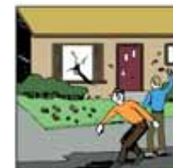
Vandalism, Riot, Civil Commotion