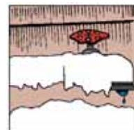
Freezing of Plumbing, Heating, or Ventilation System