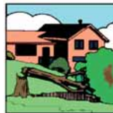
Trees, Shrubs, Other Plants