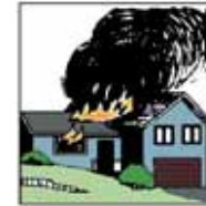
Fire or Lightning