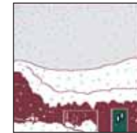
Weight of Ice, Snow, or Sleet