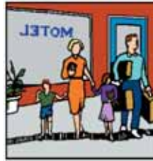
Loss of Use