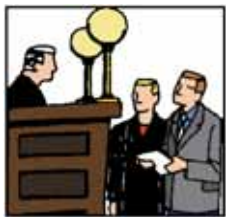
Cost to Defend Suits