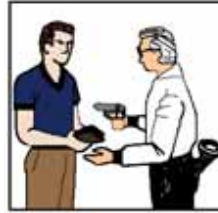
$500 Credit Card Coverage