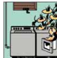
Accidental Electrical Damage