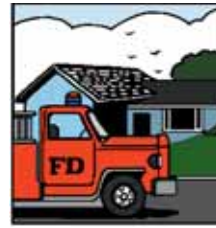
Fire Department Service Charge